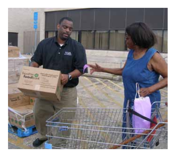
$1 = 3 mealsfor a child, senior or adult

Keegan is home to programs central to HFB's goal to end child hunger: the Backpack Buddy Club and the Kids Cafe. During FY10–11, HFB distributed food sacks to hungry children for the weekend through the Backpack program at 245 schools. Kids Cafe fed 56,400 children at 28 locations throughout the community.