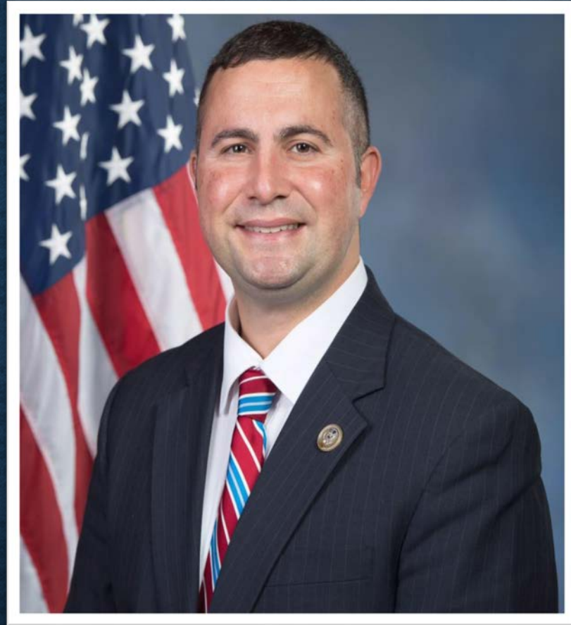
Congressman Darren Soto