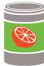
Canned Fruit (in water or juice)