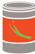
Canned Green Vegetables (no salt added)