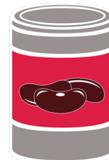
Canned Beans (no salt added)

For the safety of those we serve, the Houston Food Bank is unable to accept: