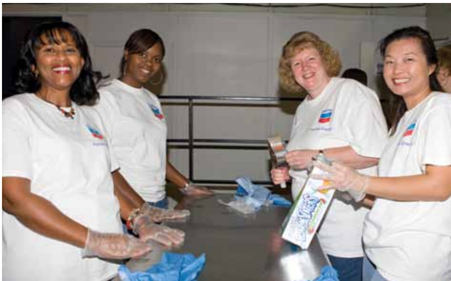
Chevron employees volunteer to help sort food at the Houston Food Bank.

The Houston Food Bank is very fortunate to consider as partners some of our community's most distinguished corporations. When thinking of groups that make an impact in the areas of volunteering, funding and in-kind gifts, Chevron immediately comes to mind.