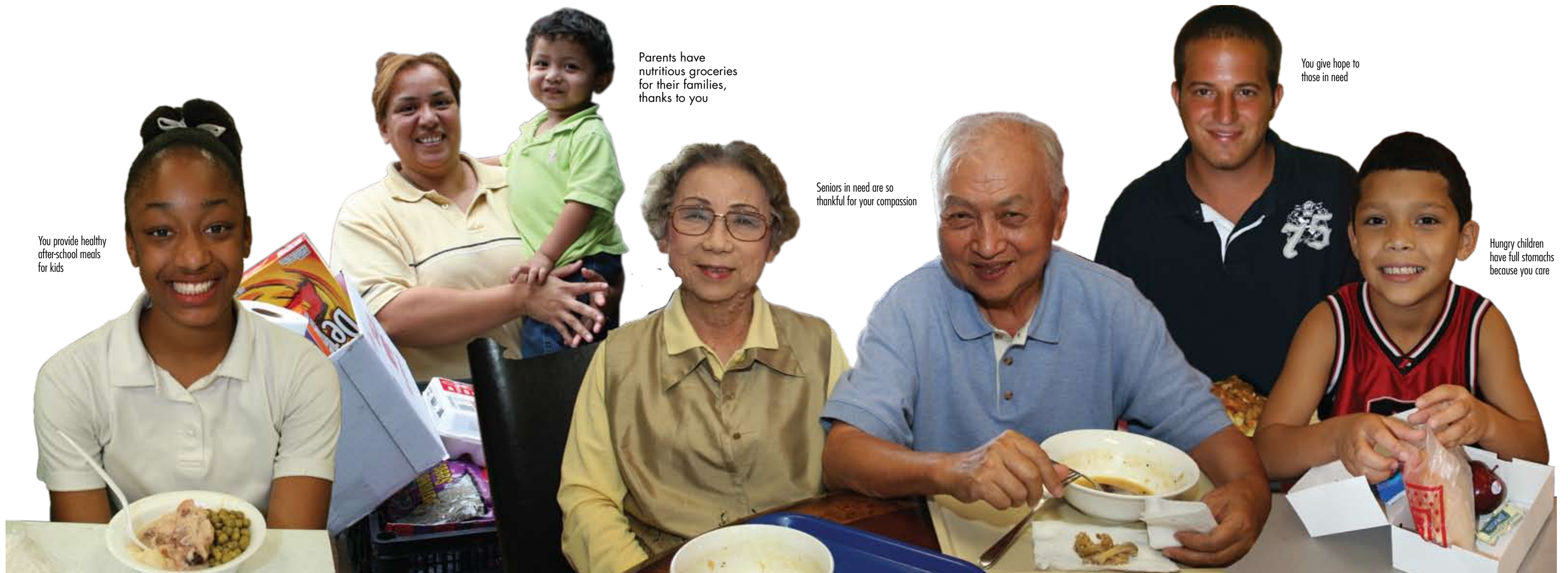
You provide healthy after-school meals for kids